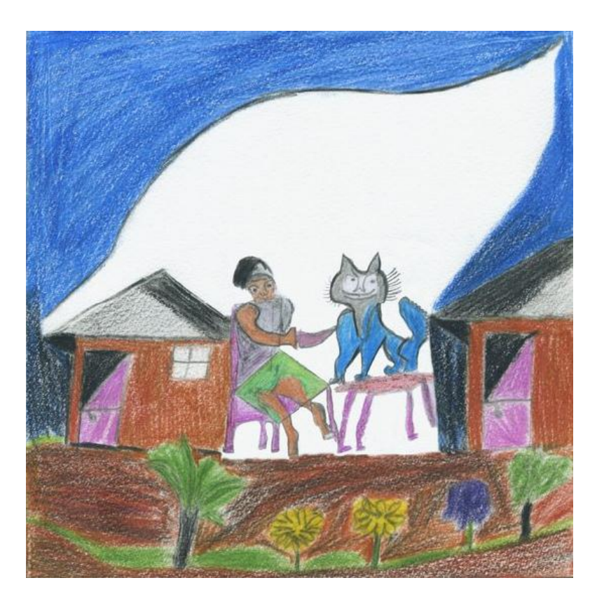
Grandmother Thabo is cooking.