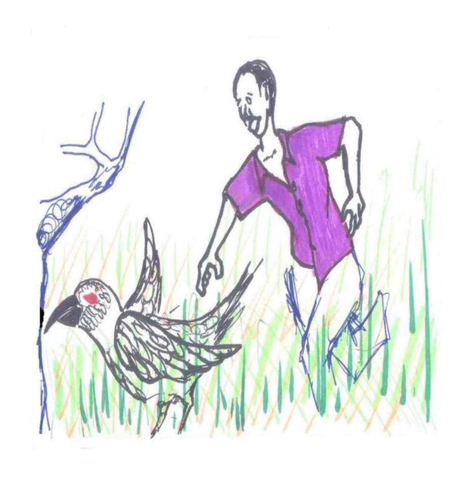
I picked up the hornbill.