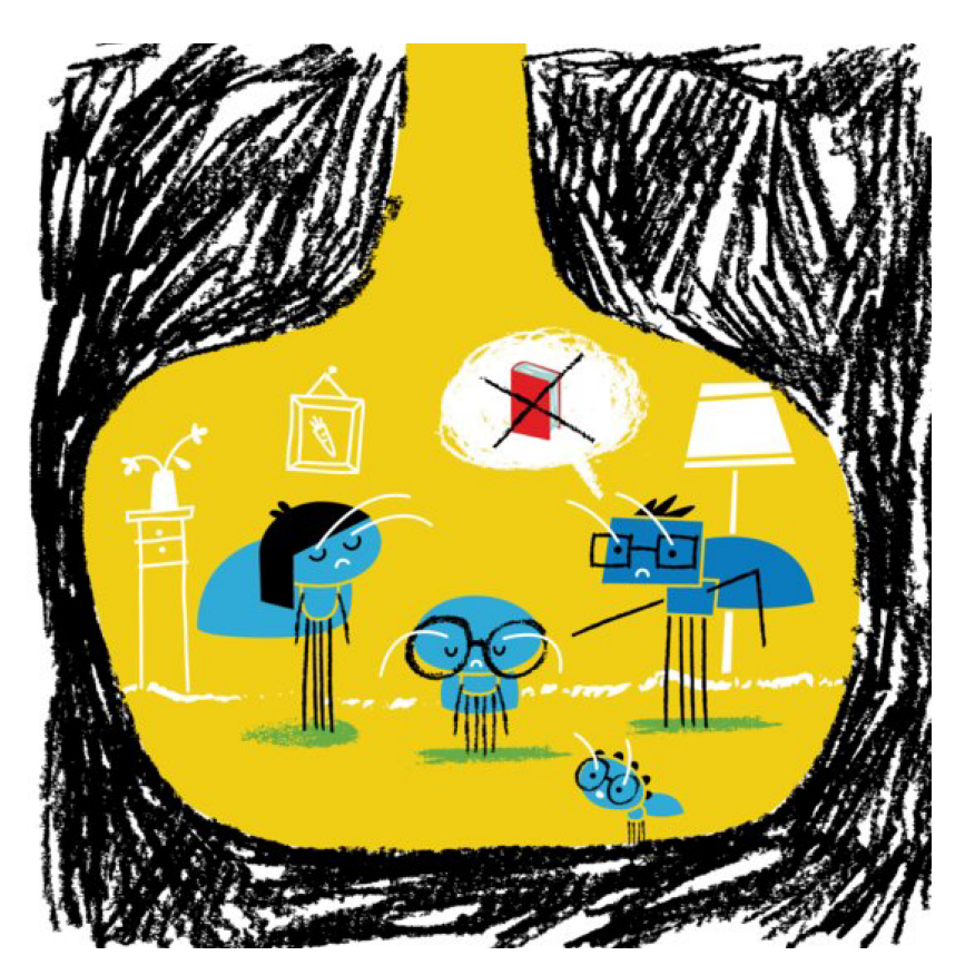
His mum and dad got really mad, and Little Ant felt really bad.