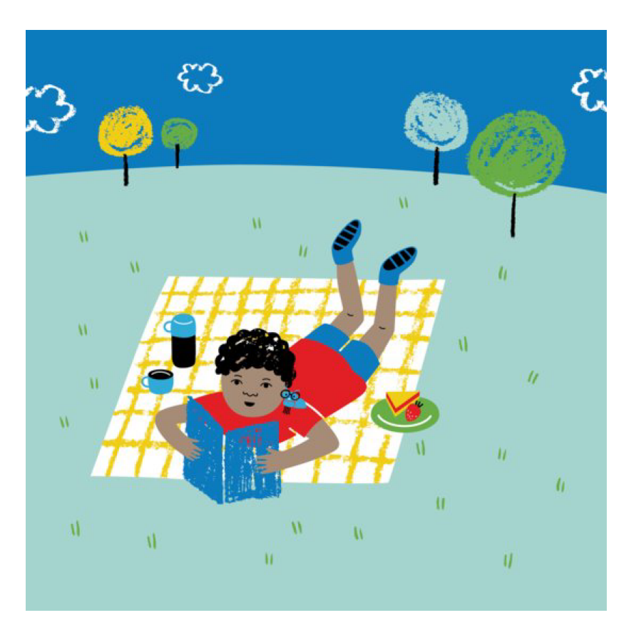
Little Ant would read all day, he'd read and read the day away.