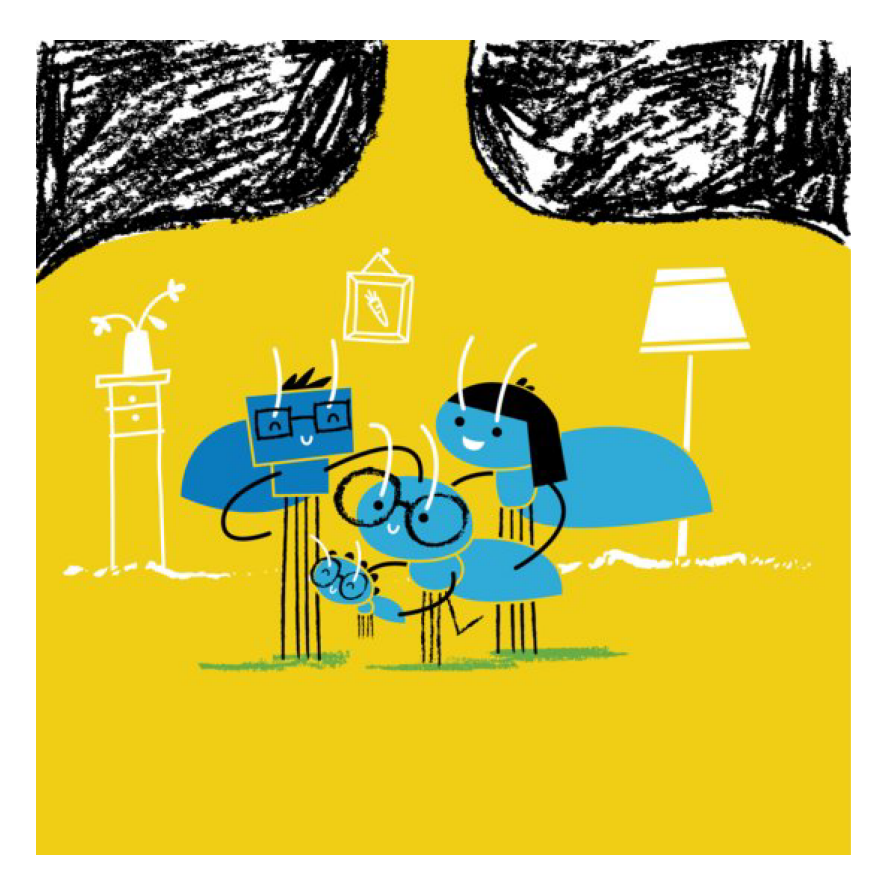
Ant gets hugs from mum and dad.