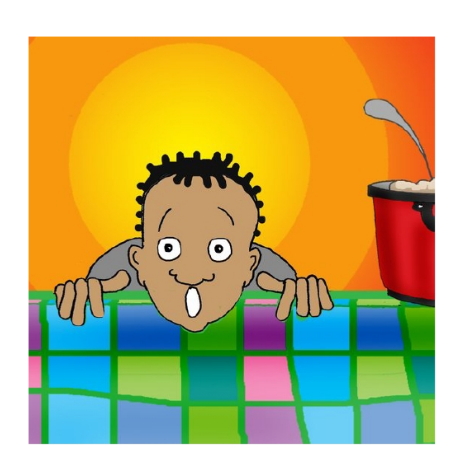
"Wu! Dad! You put salt on my porridge!"