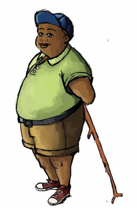
Those kids are not the same at all. Abe's round.