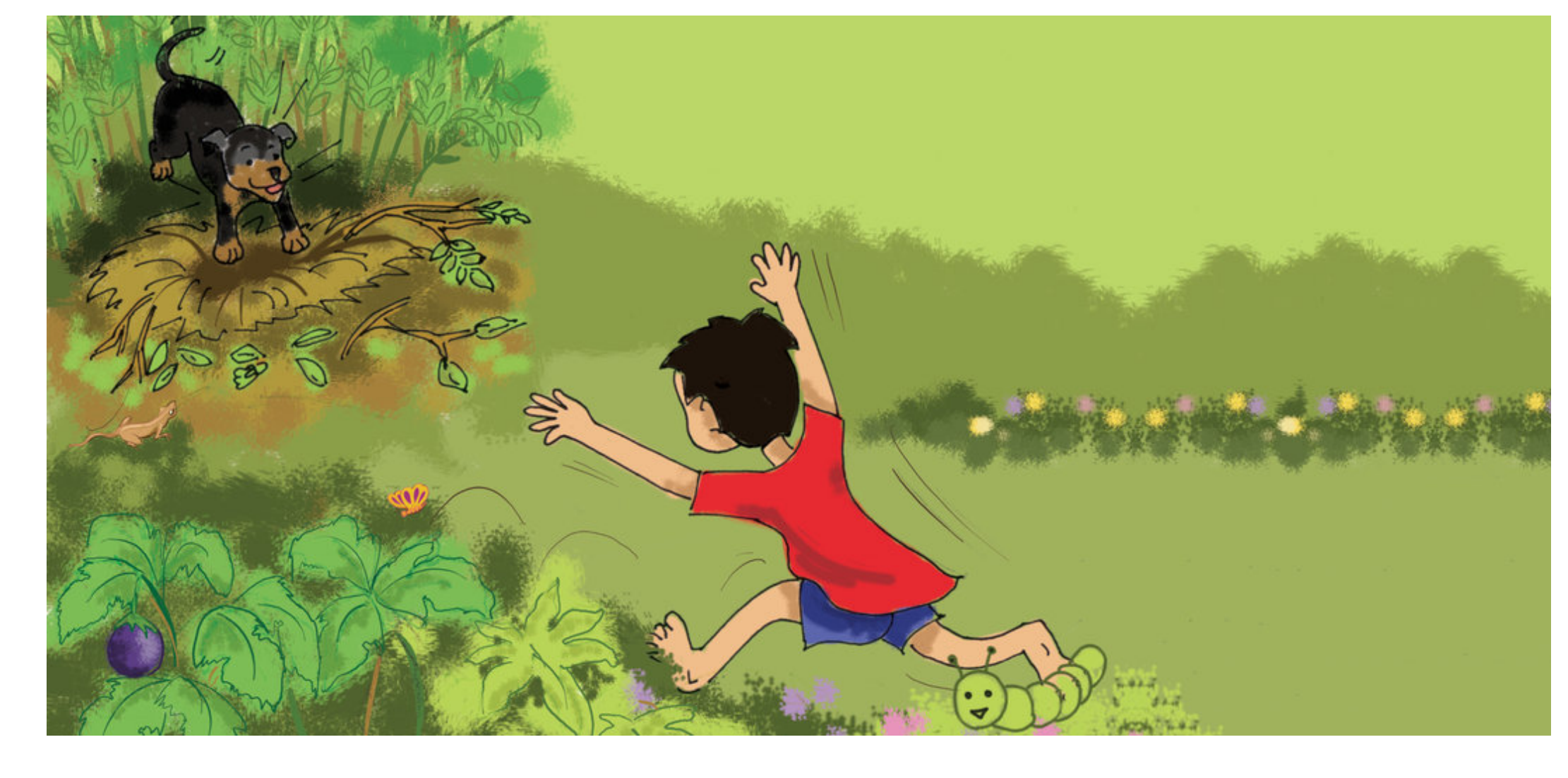
"Kaaloo! Stop, Kaaloo!" yelled Maaloo, running behind him. "Don't spoil the garden." Maaloo saw that Kaaloo was digging away and what do you think was coming out of the mud? Big fat potatoes!