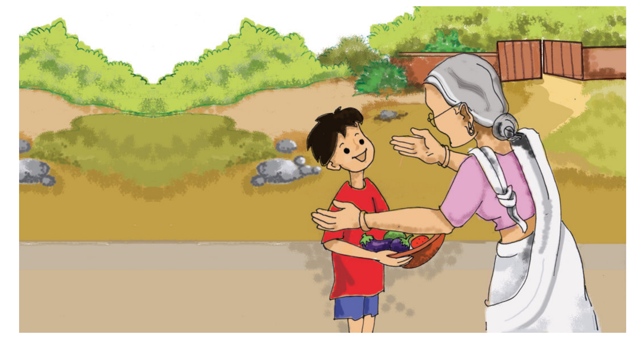
Dadi says, "Well done, Maaloo! Go and get some potatoes too."