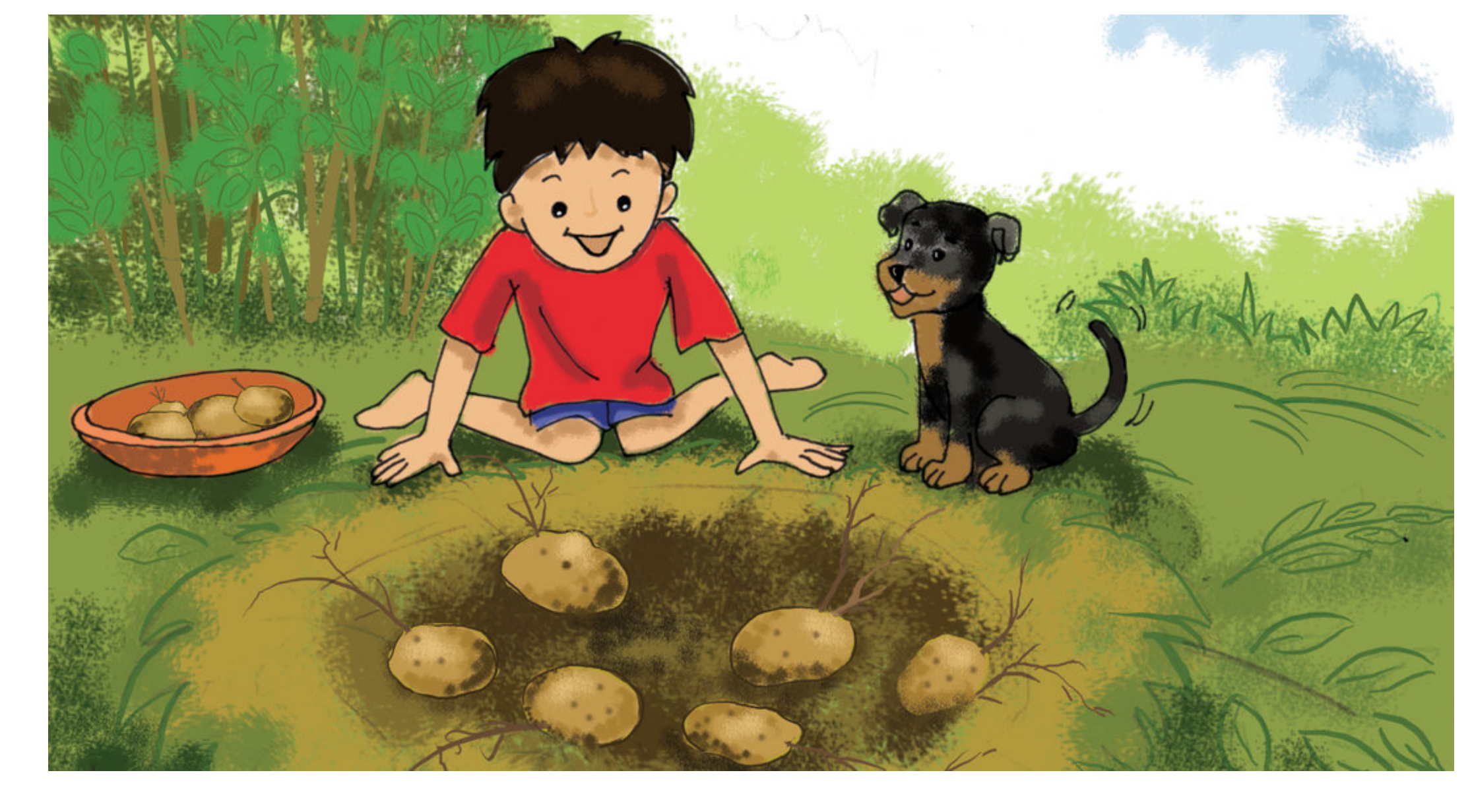
"Well done, Kaaloo. You found the potatoes!" laughed Maaloo, filling his basket with potatoes.