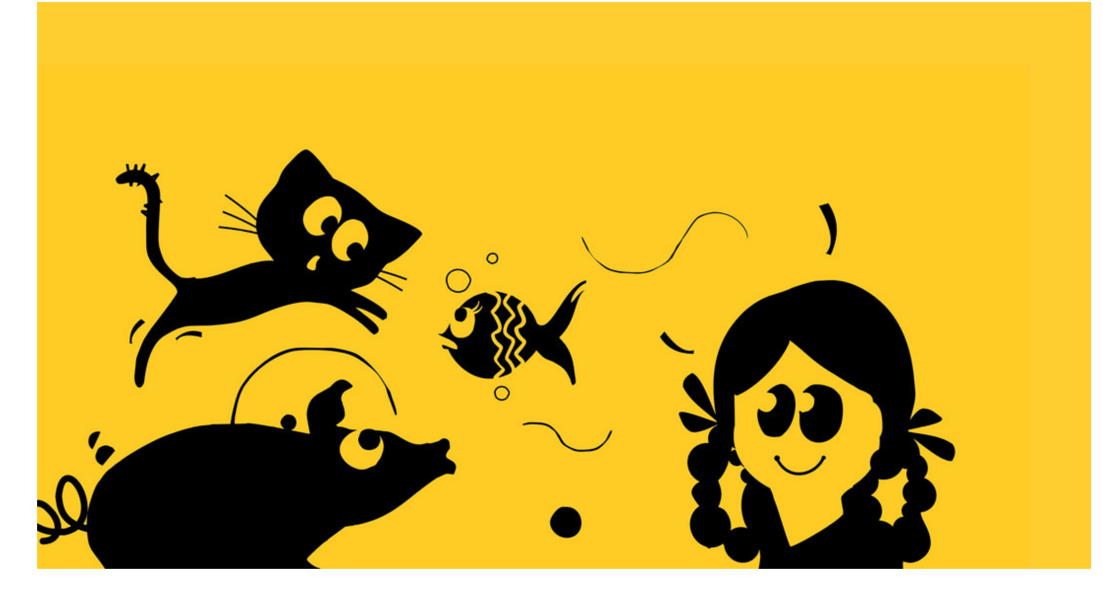
Pigs can eat, fish can swim, cats can jump... and I can read!