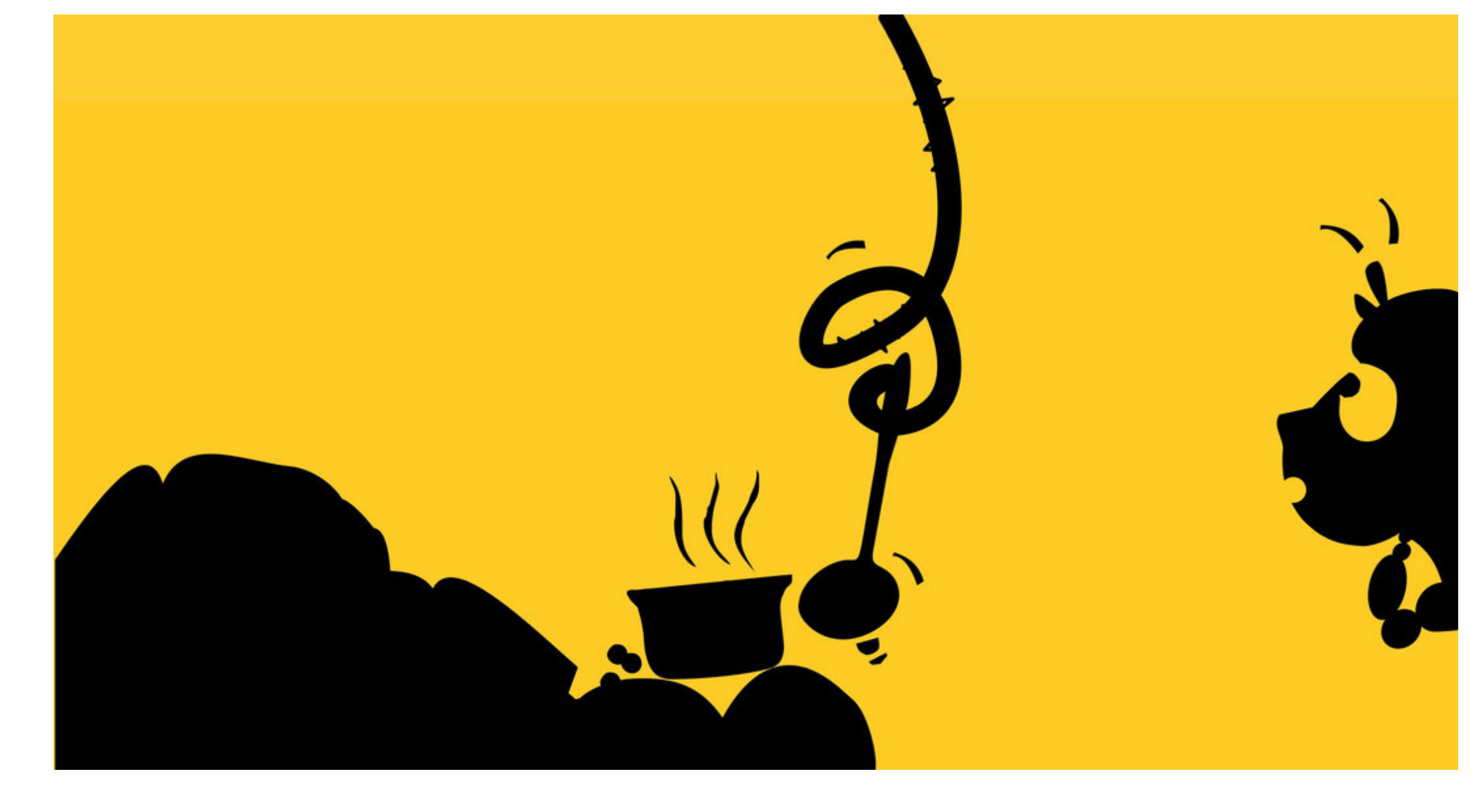
... monkeys can't cook!