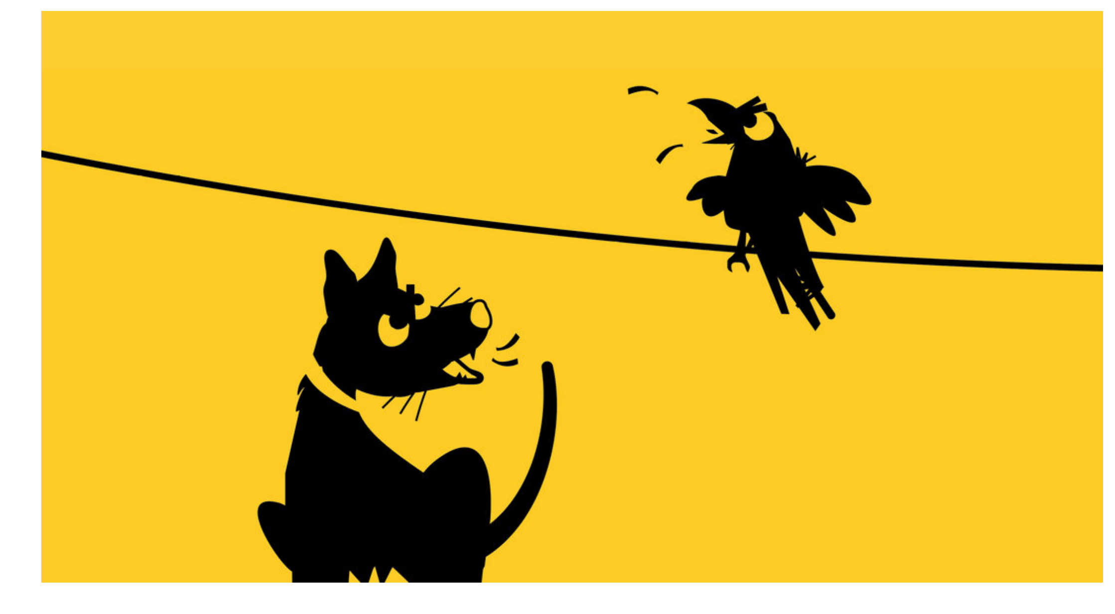
Crows can caw... ants can bite... dogs can bark!