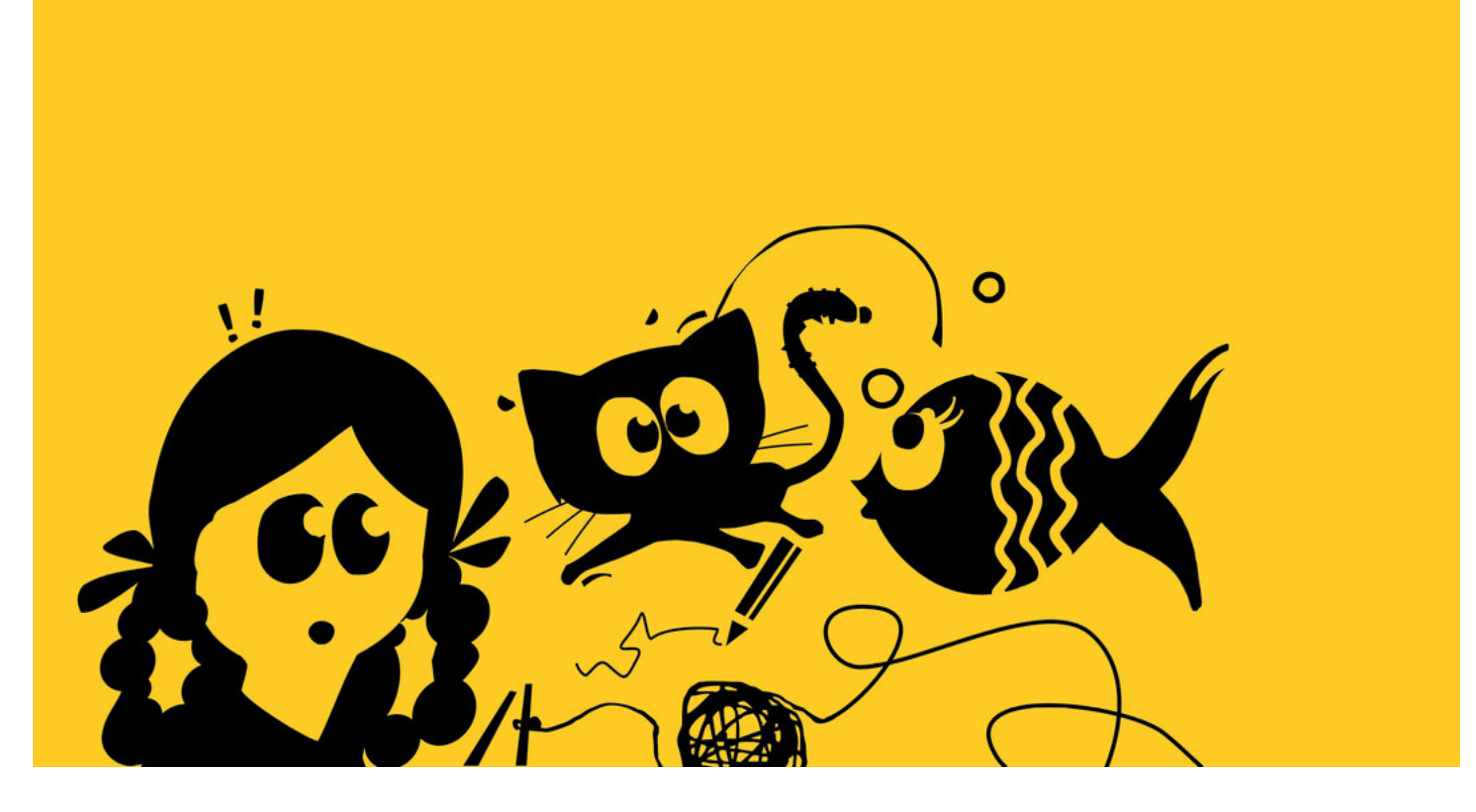
I can't knit, cats can't write, fish can't blink...