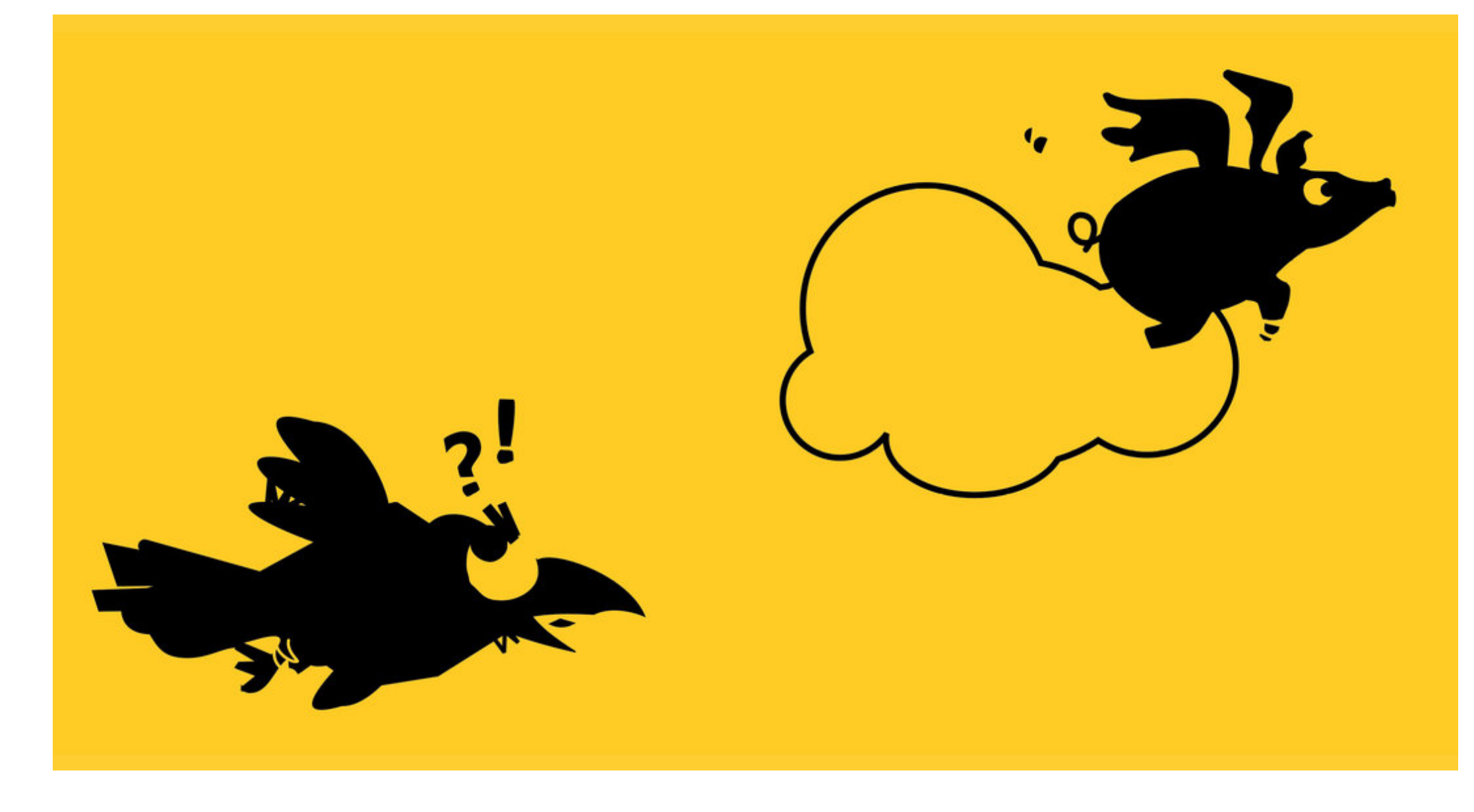
... pigs can't fly!