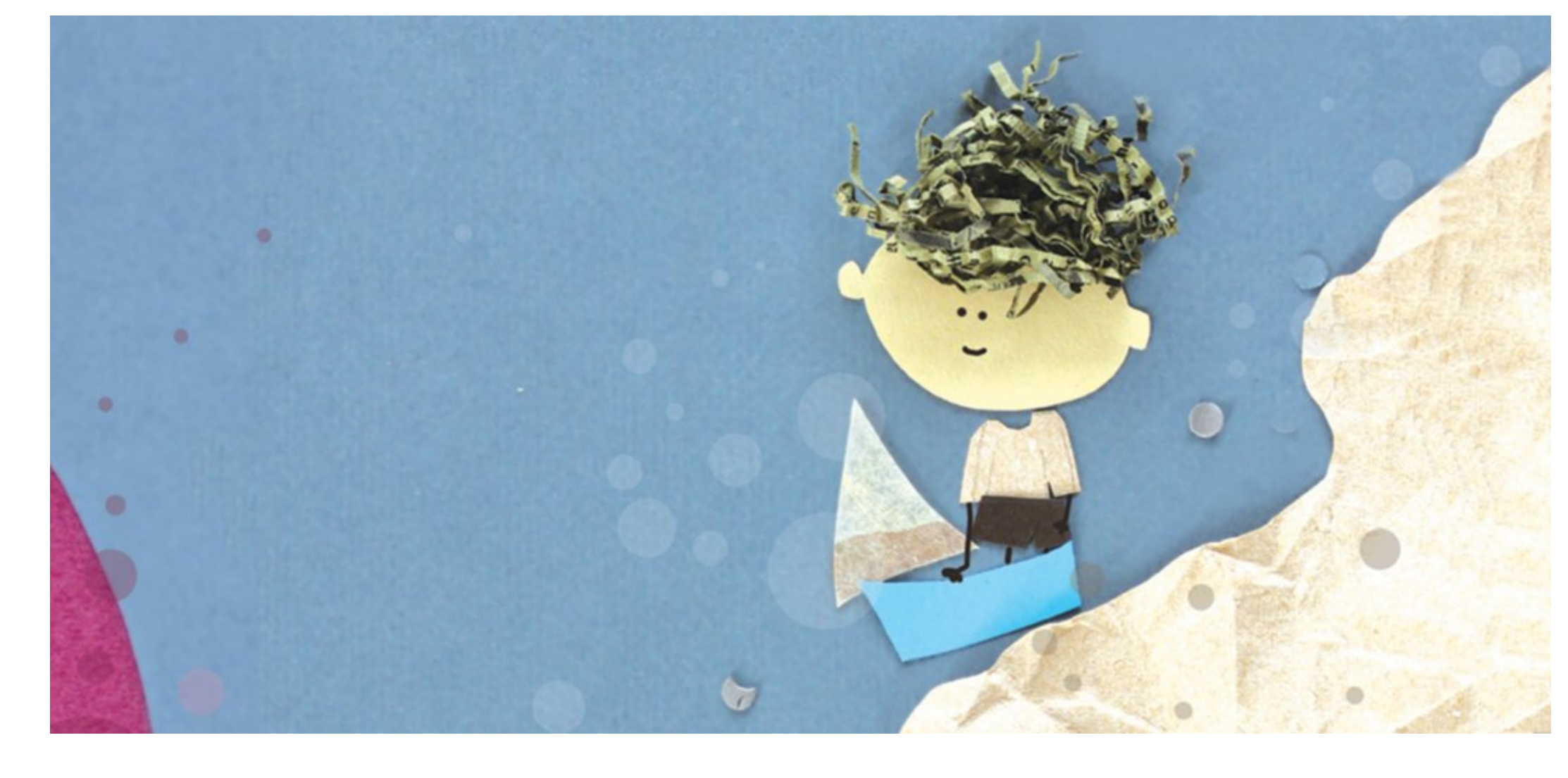
"Bittu, the famous singer will sail all around the world in this big ship!"